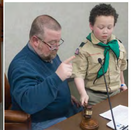
After a brief deliberation, the council votes unanimously to allow him to gavel the meeting to a close.

Consider writing for the Sentinel Contact us at 317.222.1543